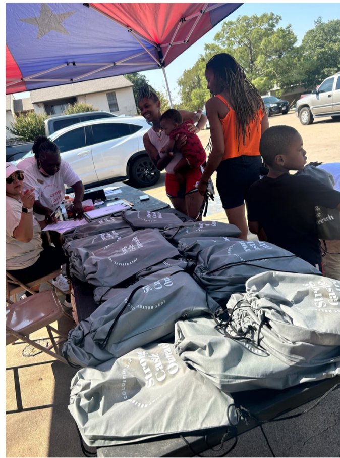
Shown In Picture Above: Back to school giveaway event 2023

Anyone can donate to Strong Castle Outreach at any time to help continue the mission of community empowerment. Just scan the code above and Donate Now!