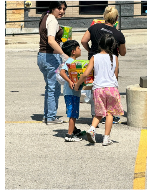
Shown In Picture Above: Family Receiving Food

Strong Castle Outreach’s programs aim to reach more families within the first each year with the support of many volunteers and local NPO’s.