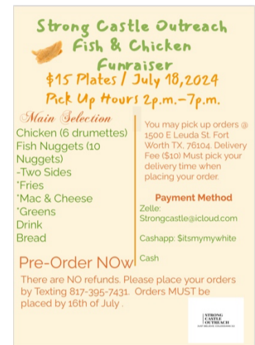
Shown in Above July Fundraiser.