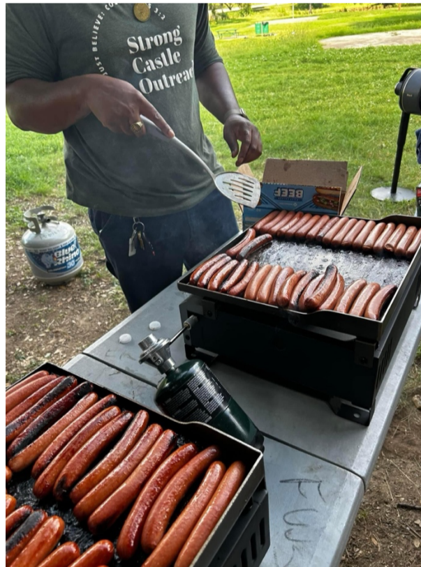
Shown in Above Picture: SCO Executive Director cooking hotdogs for homeless.