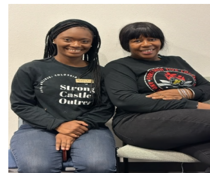
Shown in Above Picture: Co-Founder of SCO and Founder of Fort Worth 5 Loaves and 2 Fish Outreach