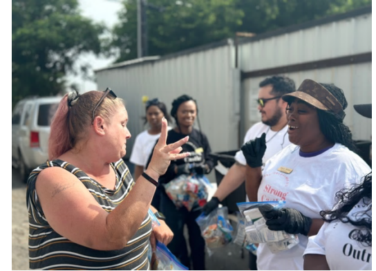
Shown In Picture Above: SCO Board Member, Co-Founder, and Volunteers with homeless mother.

Strong Castle Outreach's G.I.F.T Program aims to reach more than 2,000 families within the first year with the support of many volunteers and local NPO's.