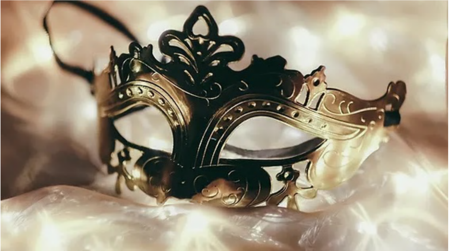
Shown in Picture Above: Strong Castle Outreach Masquerade Gala Invitation Art.