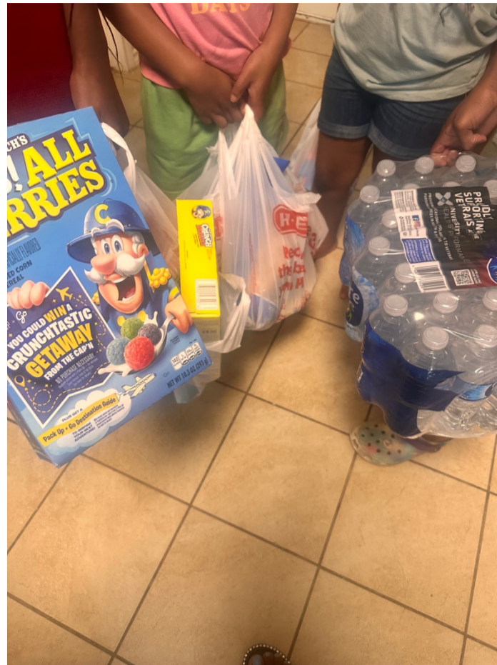
Shown In Picture Above: Family Receiving groceries through SCO G.I.F.T Program

Anyone can donate to Strong Castle Outreach at any time to help continue the mission of community empowerment. Just scan the code above and Donate Now!