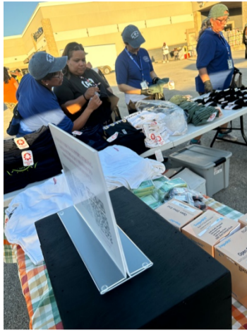
Shown in Above Picture: Code Blue Volunteers