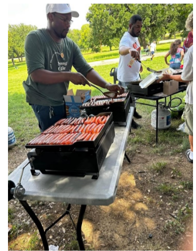
Shown in Above Picture: Strong Castle Outreach CEO volunteering with partner organization.