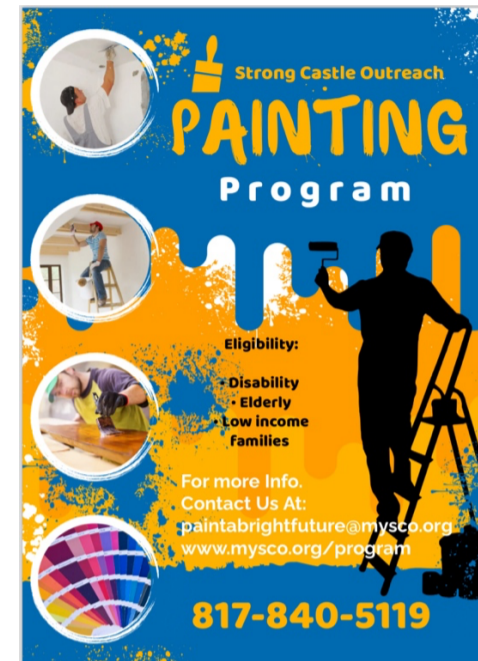
Shown In Picture Above: Painting A Brighter Future Flyer

Strong Castle Outreach's Painting A Brighter Future Program aims to reach more than 2,000 families within the first year with the support of many volunteers and local NPO's.