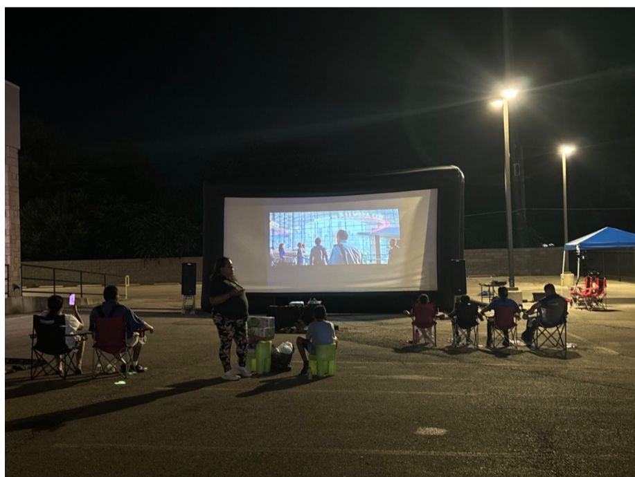
Shown In Picture Above: Families enjoying "Blue Beetle" during movie night