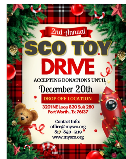
Shown in Above Picture: Co-Founder Myeisha Ross and SCO volunteer Alex Zubia standing together making a difference

Your generosity will help us bring smiles to the faces of local children. Let's make a difference in our community together!