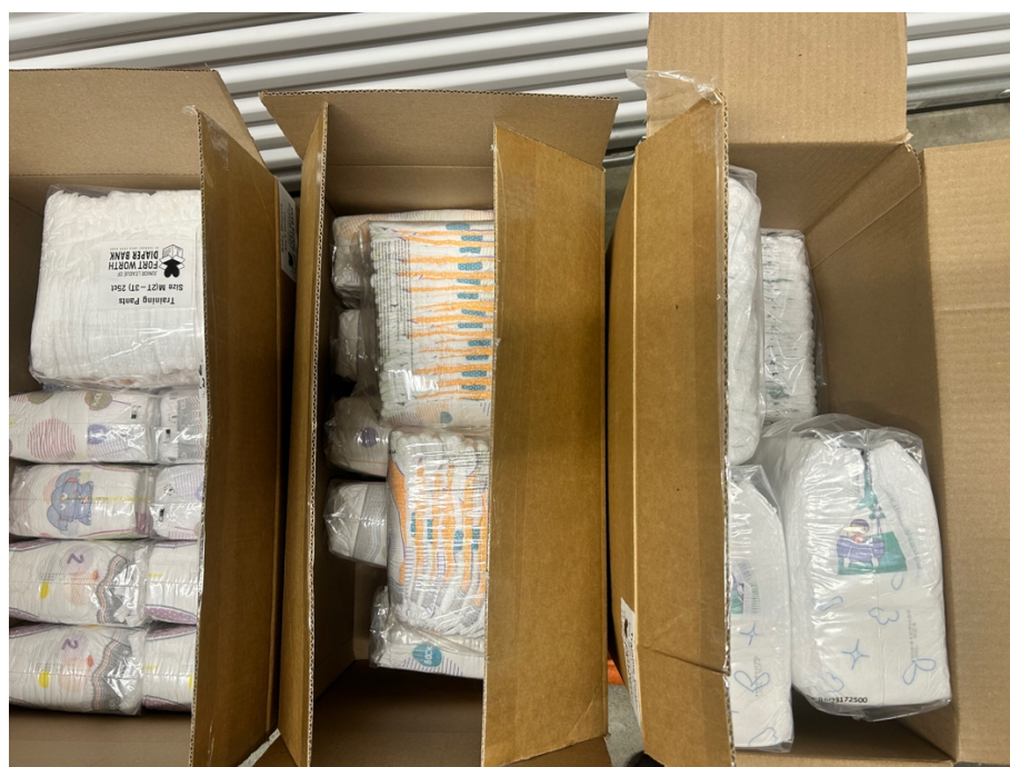
Shown In Picture Above: Strong Castle Outreach's Founder and Co-Founder and volunteers of Strong Castle Outreach.