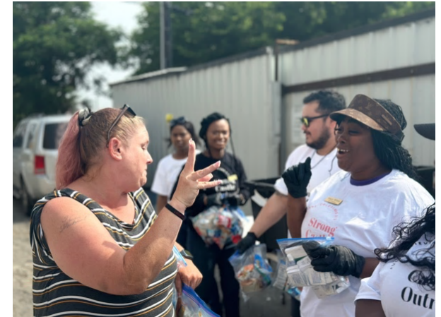
Shown In Picture Above: SCO Board Member, Co-Founder, and Volunteers with homeless mother.

Strong Castle Outreach's G.I.F.T. Program aims to reach more than 2,000 families within the first year with the support of many volunteers and local NPO's.