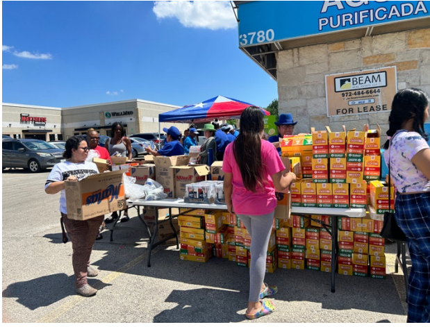
Shown in Above Picture: SCO Community Giveaway Event