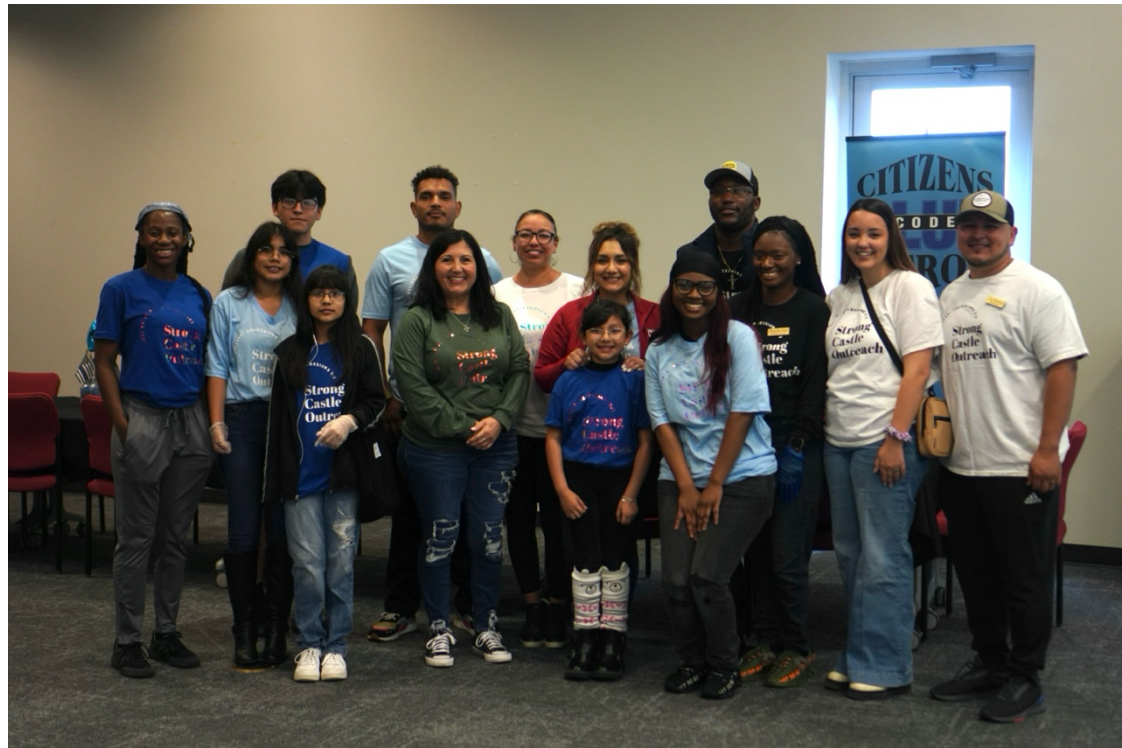
Shown In Picture Above: Strong Castle Outreach's Founder and Co-Founder and volunteers

Anyone can donate to Strong Castle Outreach at any time to help continue the mission of community empowerment. Just scan the code above and Donate Now!