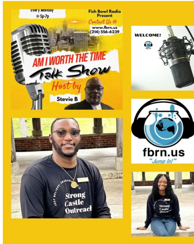
Shown in Above Picture: Founders of Strong Castle Outreach at Fish Bowl Radio Network.